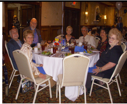
Guests who are enjoying themselves